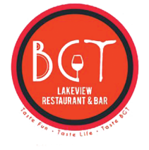
BGT Lakeview Restaurant