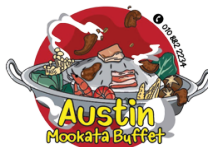
Mookata (Austin) Sdn Bhd*