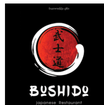
Bushido Japanese Restaurant Sdn Bhd*