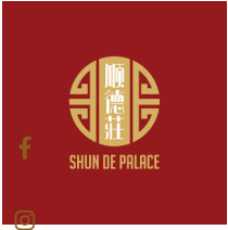
Shun De Palace Restaurant