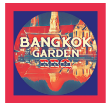
Bangkok Garden BBQ