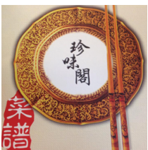
Restoran Zhen Wei Sdn Bhd*