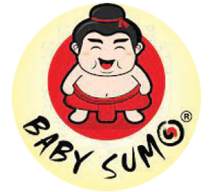
Baby Sumo Fusion Japanese Restaurant