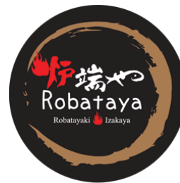
Robataya Izakaya Japanese Restaurant