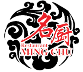
Restaurant Ming Chu