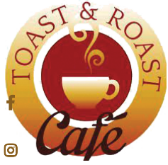
The Toast & Roast