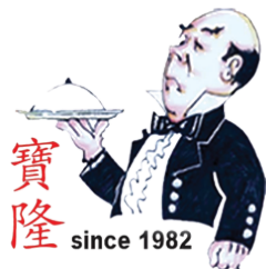
Poh Loong Restaurant Sdn Bhd