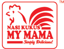
Nasi Kukus My Mama