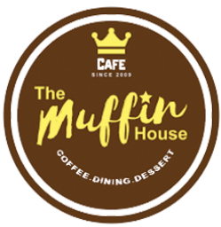
The Muffin House Sdn Bhd