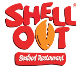
Shell Out Seafood Restaurant