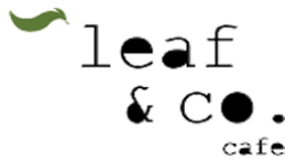
Leaf & Co. Cafe