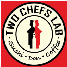
Two Chefs Lab Japanese Restaurant