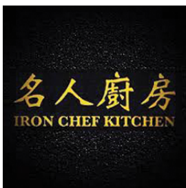
Iron Chef Kitchen