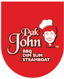
Pak John Food Sdn Bhd