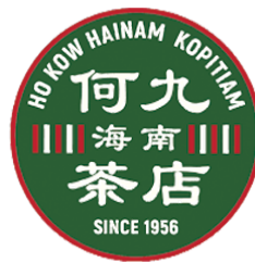
Ho Kow Hainanese Kopitiam