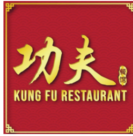
Kung Fu Restaurant