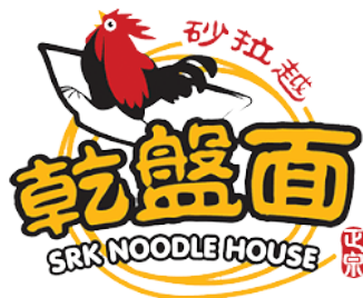
SRK Noodle House