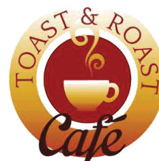
Toast & Roast