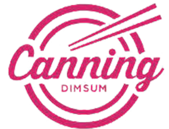
Canning Dim Sum