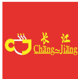
Chang Jiang White Coffee