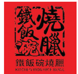
Kitchen Iron Rice Bowl