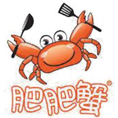
Signature Fei Fei Crab