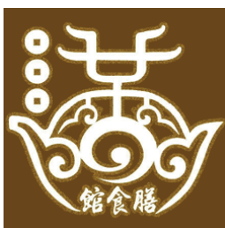
Man Shan Bak Kut Teh