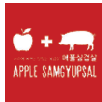
Apple Samgyupsal Korean BBQ Restaurant