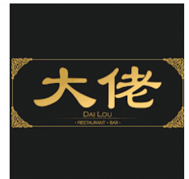
Dai Lou Restaurant & Bar