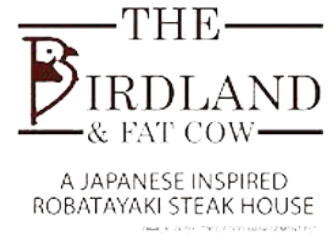
The Birrdland & Fat Cow