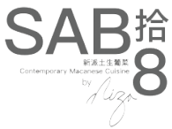
Cafe Sab 8