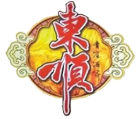
New TS VIP Restaurant